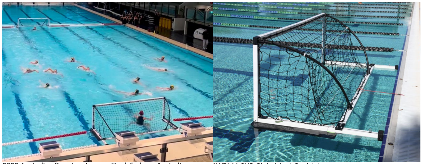
2023 Australian Premiere League Final, Sydney, Australia